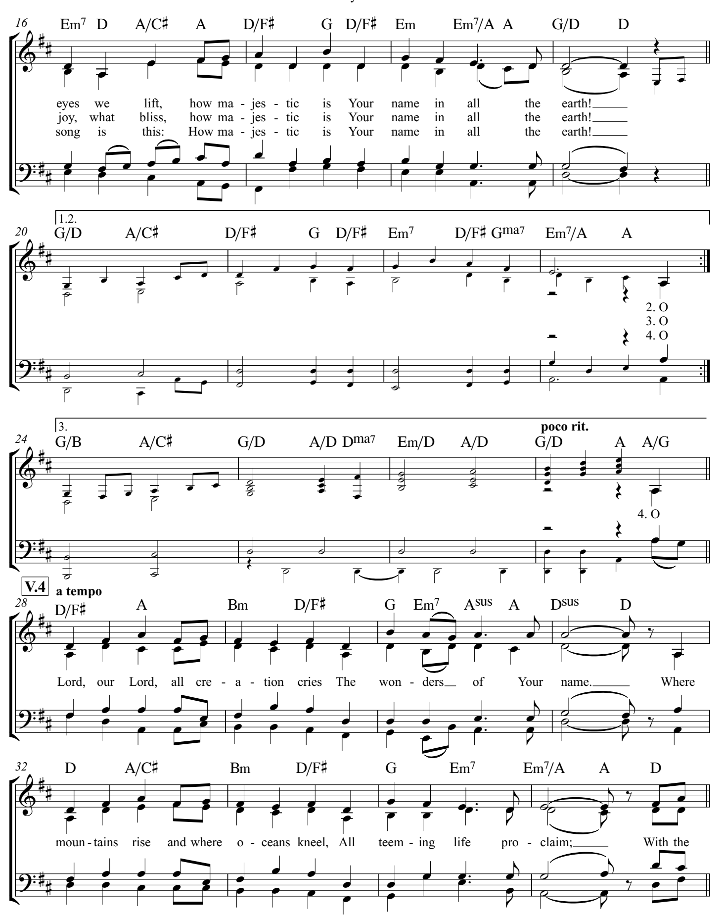
O Lord, Our Lord, How Majestic (Psalm 8) (Key of D)